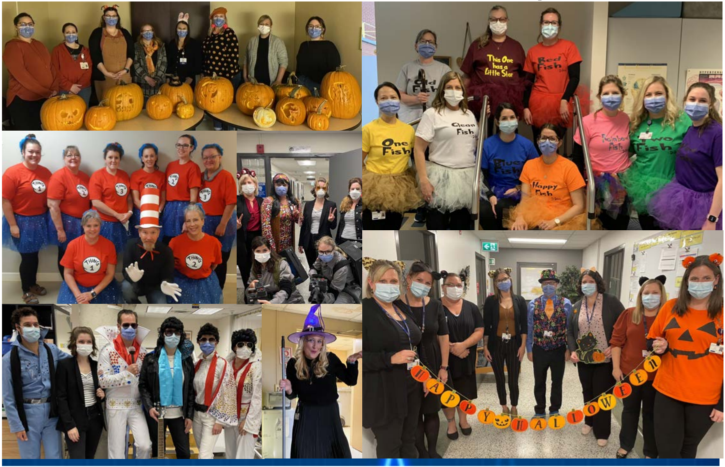
Take Your Kids To Work Day 2022